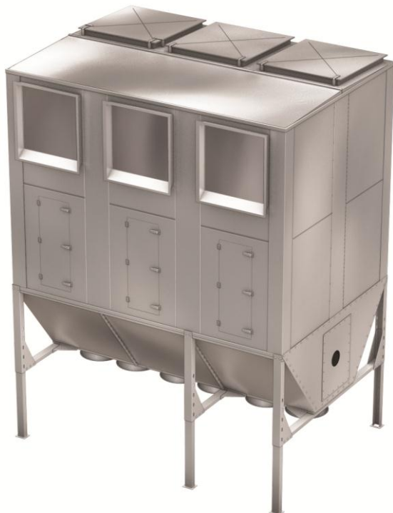
Example: NFPZ3000 3 HJ modules with side and top venting for St2 dust

The filter is designed for small air flows with limited material content.