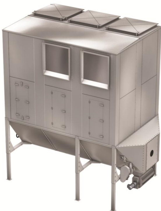
Example: NFKZ3000 2+1 HJ filter with side and top venting for St2 dust.

Compact filter, suited for handling large air flows with heavy material content.